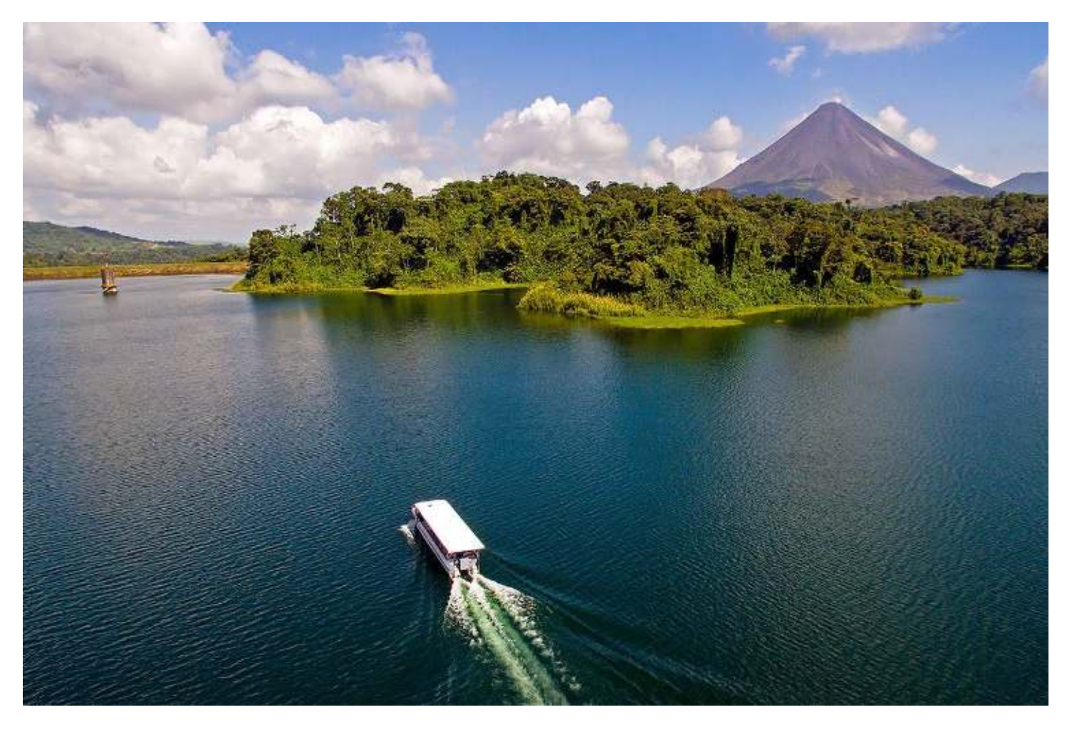
Day 7. FREESTAYLE DAY IN MONTEVERDE. (B). Customize your vacation with the included adventure of your choice. Please select one. This option will be added to your final itinerary.