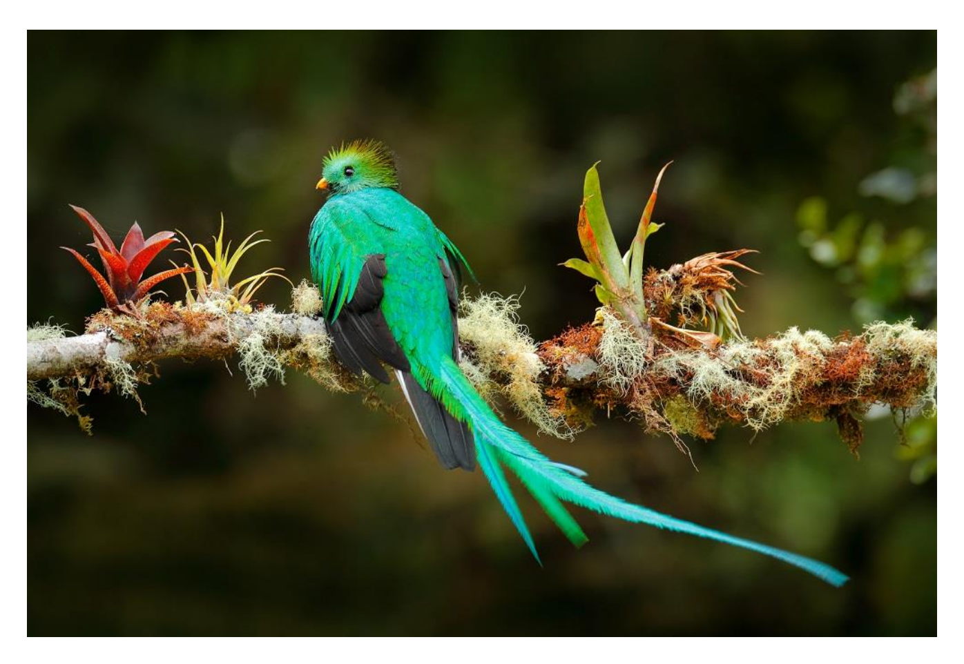
Day 8. MONTEVERDE – MANUEL ANTONIO (B). During the morning, land transfer to Manuel Antonio National Park on the Central Pacific Coast. Upon arrival, check in at Hotel Costa Verde and free time for enjoy the swimming pool or visit the beach.