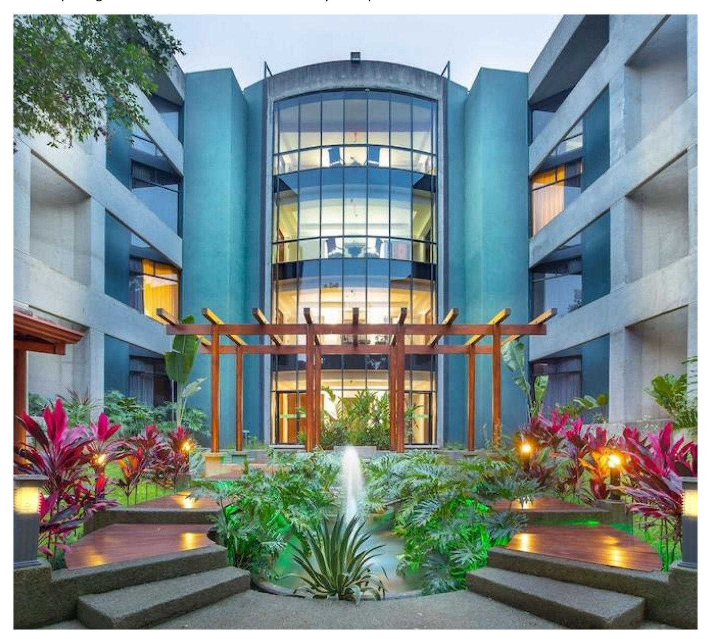
Day 2. TORTUGUERO NATIONAL PARK (B, L, D) Our exclusive journey to Tortuguero from San Jose is an amazing experience where you will enjoy a pleasant bus transfer to Guapiles Town. Along the way, admire the pristine rainforest of the Braulio Carrillo National Park and Biosphere Reserve declared by UNESCO in 1988. Crystal clear rivers and beautiful waterfalls will be part of the landscape that you can enjoy during this short transfer. Once in Guapiles Town, a

Day 1. WELCOME TO COSTA RICA. Arrival to the International Airport Juan Santamaria. Upon arrival at the San Jose airport, you will be met by one of our representatives how will explain your itinerary, answer any questions and provide you with a package of vouchers and information about your trip. Transfer to Hotel Radisson and free time at leisure.