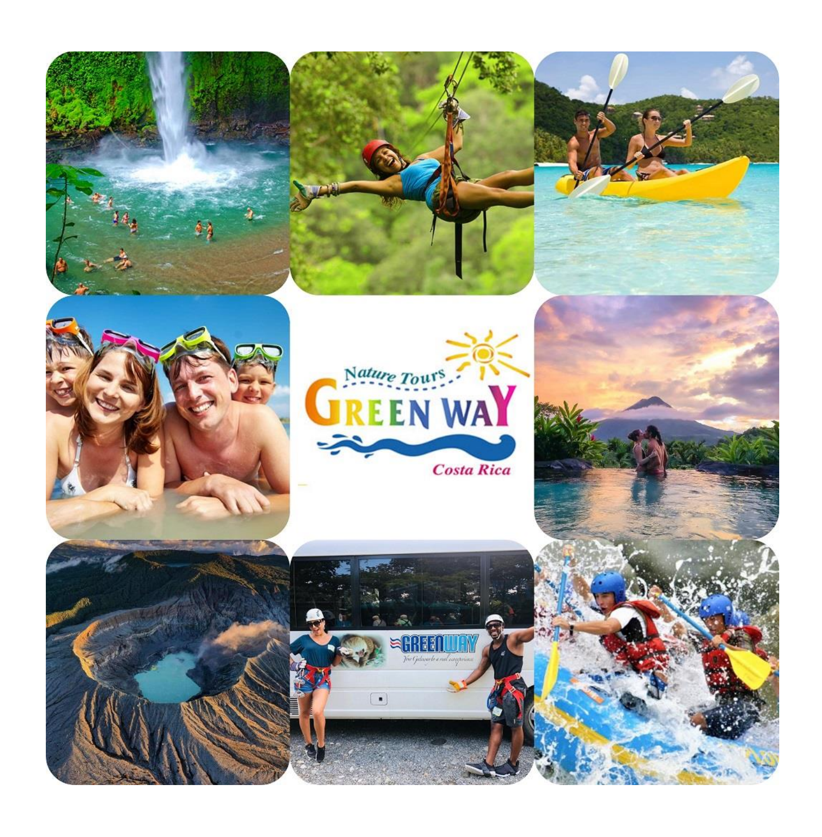
COSTA RICA VACATION PACKAGES & PRIVATE TOURS