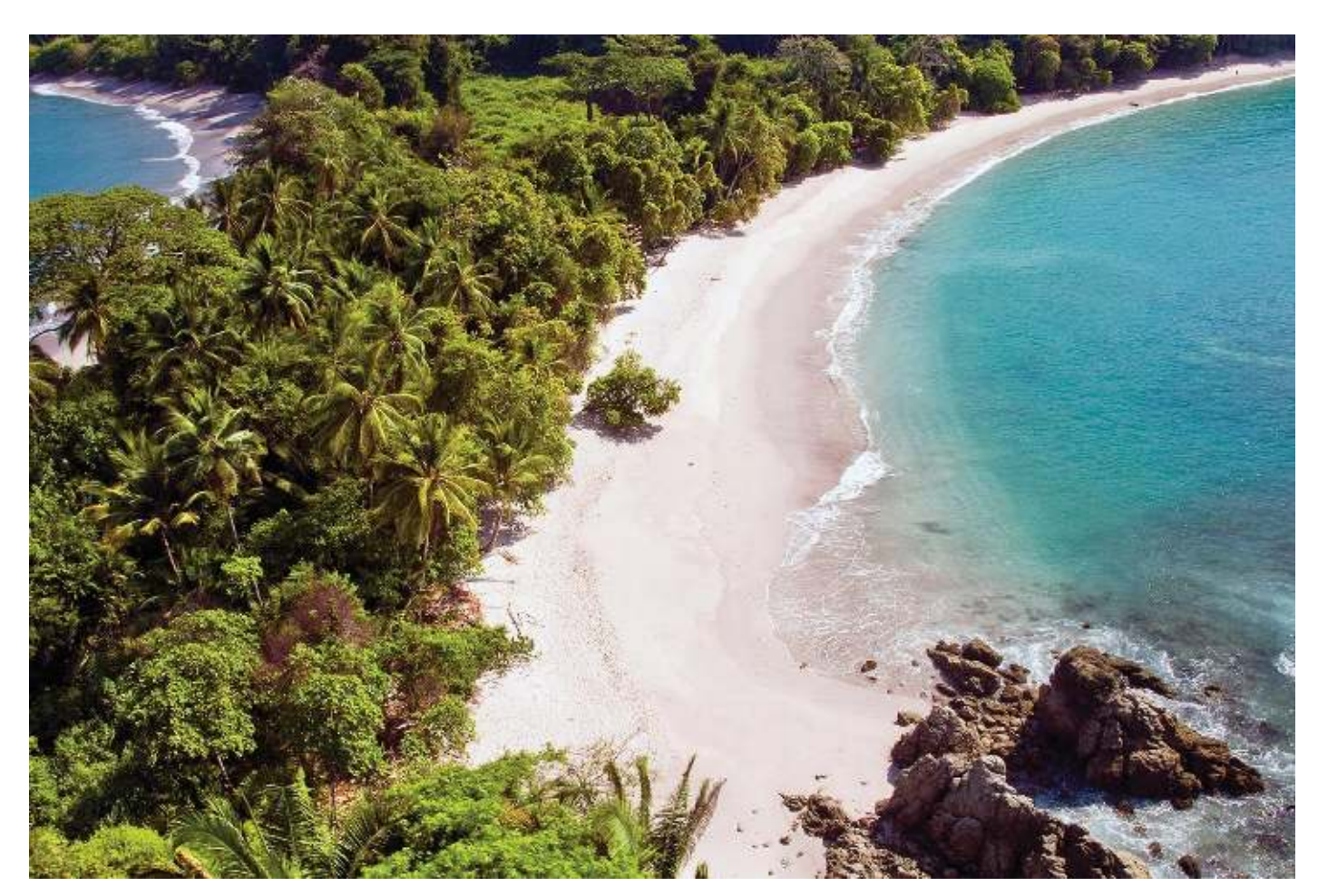
Day 11. MANUEL ANTONIO - SAN JOSE (B). During the morning, a great opportunity for explore the surroundings on your own and enjoy the beach. After lunch, land transfer to San Jose. Overnight at Hotel Radisson . Free time.

Day 12. TRANSFER OUT. (B) Transfer to the International Airport accordingly with your scheduled flight and Goodbye.