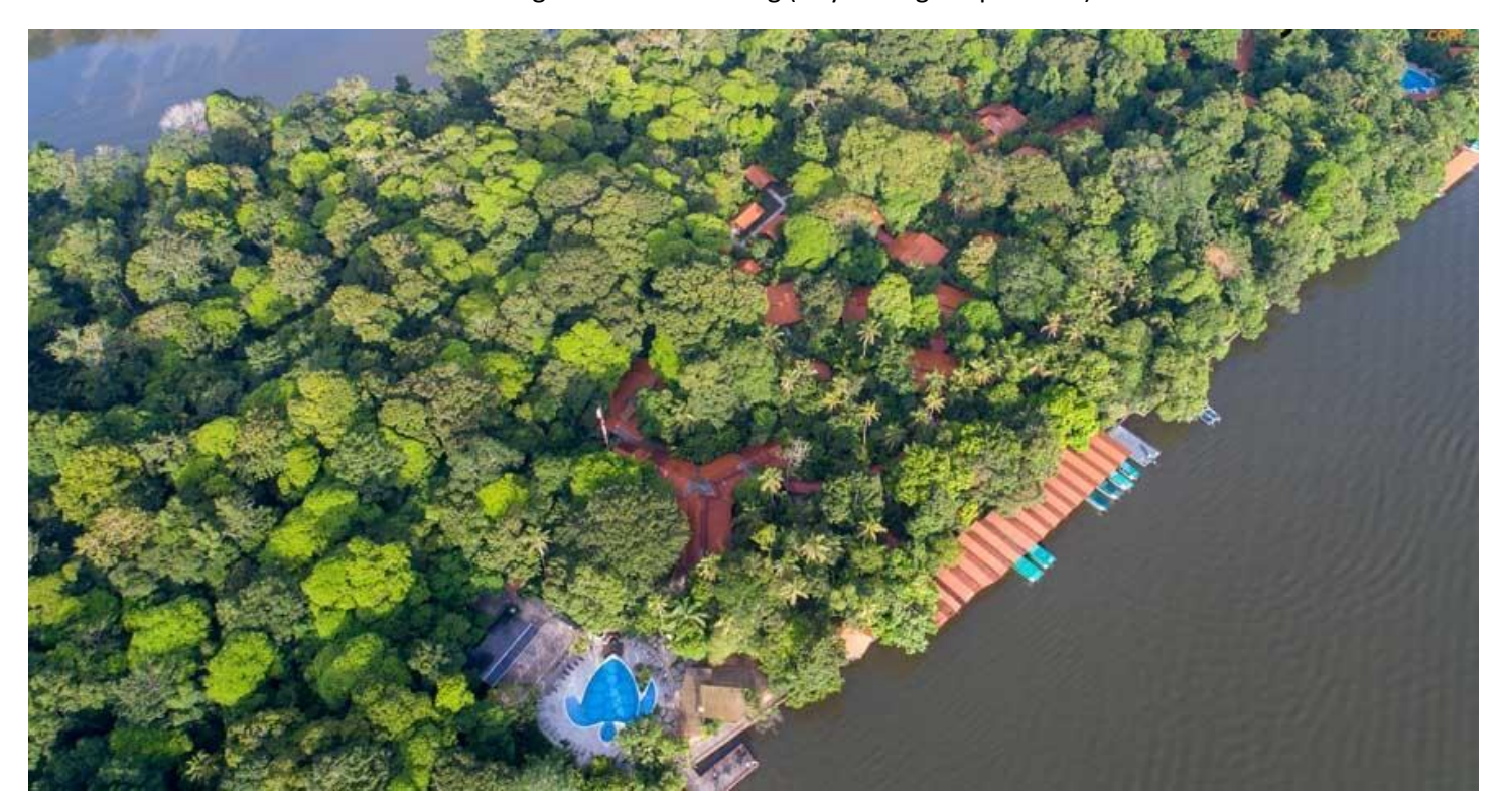
Day 4. TORTUGUERO - ARENAL (B, L). After breakfast, hotel check out and transfer to our next destination. On the middle of the way and after lunch, you will meet your shuttle bus transportation and proceed overland to Arenal, arriving at our accommodation for the next two nights. Our comfortable Hotel Arenal Paraiso offers panoramic views of Arenal Volcano.